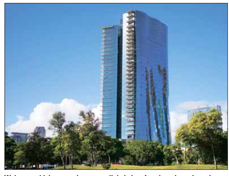
Waiea — with its sweeping, unparalleled glass facade and spacious vieworiented interiors, this 36-floor tower represents a level of architectural sophistication never before available in Hawaii.

"Waiea" (meaning "water of life" in Hawaiian) has a unique glass facade and will be the first to be completed.