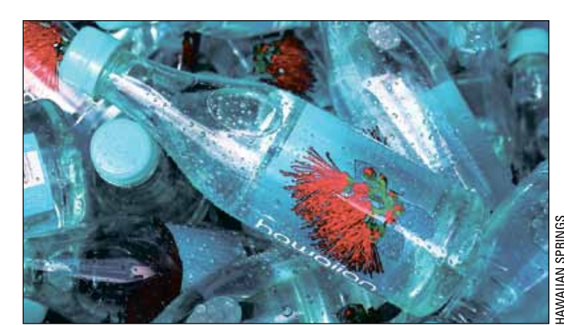
Ka Wai Ola (The water of life) is drawn from deep earth aquifers, filtered through 4,000 meters of ancient lava rock, laden with minerals and electrolytes producing water as soft and sweet as the "Ōhi'a lehua" blossom

These days, Hawaiian Springs likes to highlight its premium position in the Japanese market by sharing its unique and natural source of water with Japa-